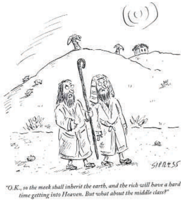
© DAVID HIRSH / THE NEW YORKER COLLECTION / WWW.ARTISTSONLINE.COM