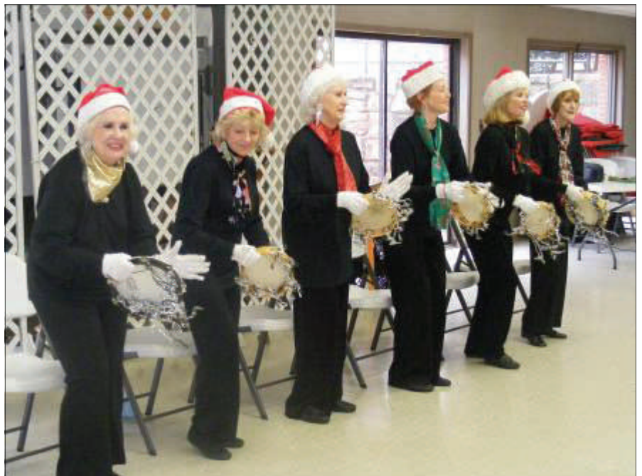
Georgia Classic Club performing for the Senior's Ministry in 2009. This is the eighth year that the lovely ladies have brought their Christmas cheer to the monthly luncheon.